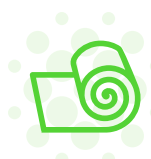
Cast extrusion and blown film extrusion