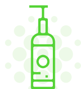
Injection blow moulding